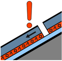
Persistent Weak Layers