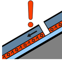
Persistent Weak Layers